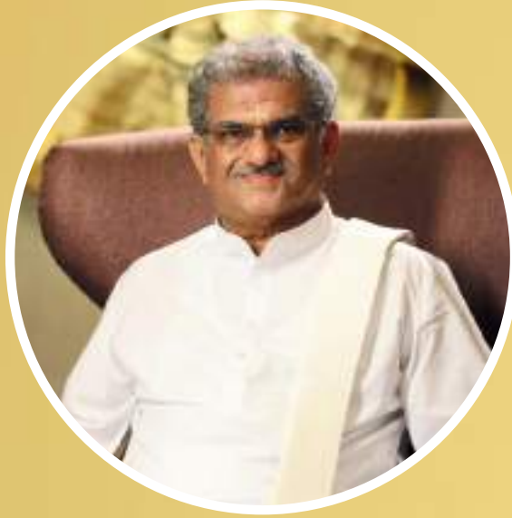
Dr. D Veerendra Heggade President SDMES Ujire